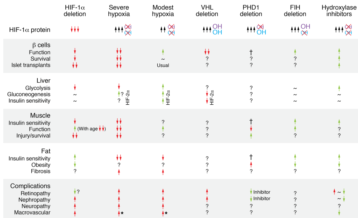
Figure 3. HIF-1α and diabetes: effects and unknowns. Purple “OH” indicates hydroxylation of HIF-1α on proline residues, and blue “OH” indicates hydroxylation on asparagine residues. In the liver, HIF-2α rather than HIF-1α primarily mediates some effects, as indicated. Red arrows indicate primarily deleterious effects of either increasing or decreasing hypoxia, green indicates beneficial effects, and “~” indicates neutral effects. Question marks indicate unknowns and areas for potential future investigation. †Whole-body hypoxia is decreased on chow, but improved on high-fat diet. *Note that while hypoxia is clearly a feature of macrovascular disease, hypoxic pre-exposure before the event (i.e., stroke or myocardial infarct) improves outcomes. Overall, fully hydroxylated HIF and severe hypoxia are both deleterious.

HIF-1α and adipose tissue. Effects in adipose tissue suggest that the relative hypoxia seen with obesity, which is associated with increased HIF-1α protein, leads to increased fibrosis in fat (60, 61). Similar increases in fibrosis are seen with overexpression of a constitutively active HIF-1α (62).