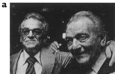
Figure 2 The Deathblow to a long-term partnership. (a) Alan Jay Lerner, left, and Frederick Loewe, right, the legendary partnership of 17 years that produced My Fair Lady and many other hit musicals on Broadway. (b) Obituary of Alan Lerner published on the front page of The New York Times on June 15, 1986. (c) Obituary of Frederick Loewe published on the front page of The New York Times on February 15, 1988.