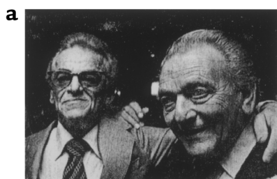
Figure 2 The Deathblow to a long-term partnership. (a) Alan Jay Lerner, left, and Frederick Loewe, right, the legendary partnership of 17 years that produced My Fair Lady and many other hit musicals on Broadway. (b) Obituary of Alan Lerner published on the front page of The New York Times on June 15, 1986. (c) Obituary of Frederick Loewe published on the front page of The New York Times on February 15, 1988.