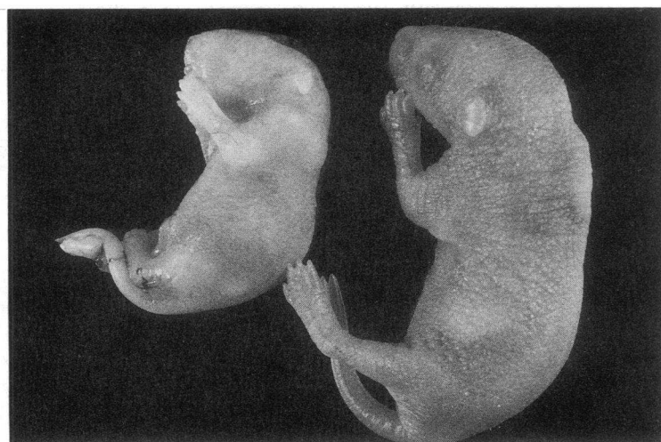
Figure 2. Representative embryos from mice that were immunized with anticardiolipin antibodies 1 d after mating and killed on day 17 of pregnancy. A marked difference in size between the IL-3 treated mouse (right) and control (left) can be seen.

IL-3 is capable of increasing platelet number both in vitro and in vivo , due to a de novo production of megakaryocytes (22–24). The results obtained in the present study indeed indicate an increase in the number of megakaryocytes in the bone marrow followed by peripheral blood thrombocytosis (Table II). Although the exact role of platelets in the pathogenesis of APLS is not yet sufficiently clear, the ability to improve platelet numbers may be a significant clinical finding. In other studies (data not shown) we also examined the effect of low dose aspirin and low molecular heparin on the resorption rates of the experimental APLS. Low dose aspirin decreased the resorption rate from 46 to 11%, while low molecular heparin was effective in reducing the fetal loss from 42 to 12%. IL-3 seems