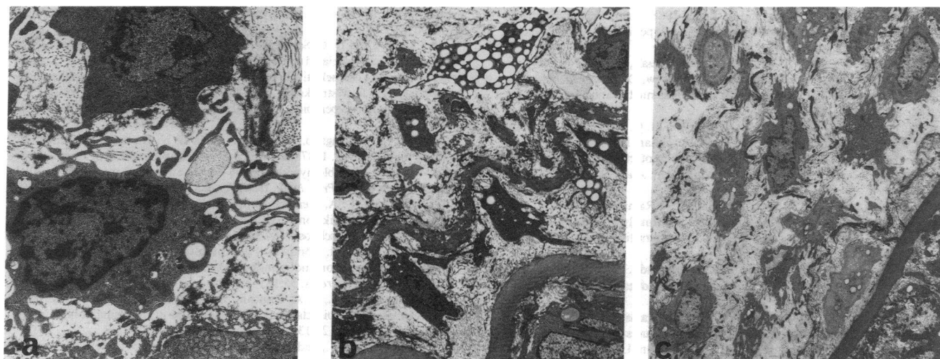
Figure 3. Electron micrographs of the intima from a control rabbit showing (a) SMC containing synthetic organelles and some lipid droplets ( \times 8,000 ), (b) a section of the internal elastic lamina, SMC, and a foam cell ( \times 2,400 ), and (c) the intima of a BHT-treated rabbit showing densely packed SMC in the vicinity of the internal elastic lamina ( \times 2,400 ).

To further evaluate these possibilities, detailed analysis is required of the effect of antioxidant treatment on intimal growth factor production during the early period after balloon injury. However, whatever the mechanisms, the results clearly demonstrate that the presence of the antioxidant BHT modified the arterial response to injury in moderately hypercholesterolemic rabbits.