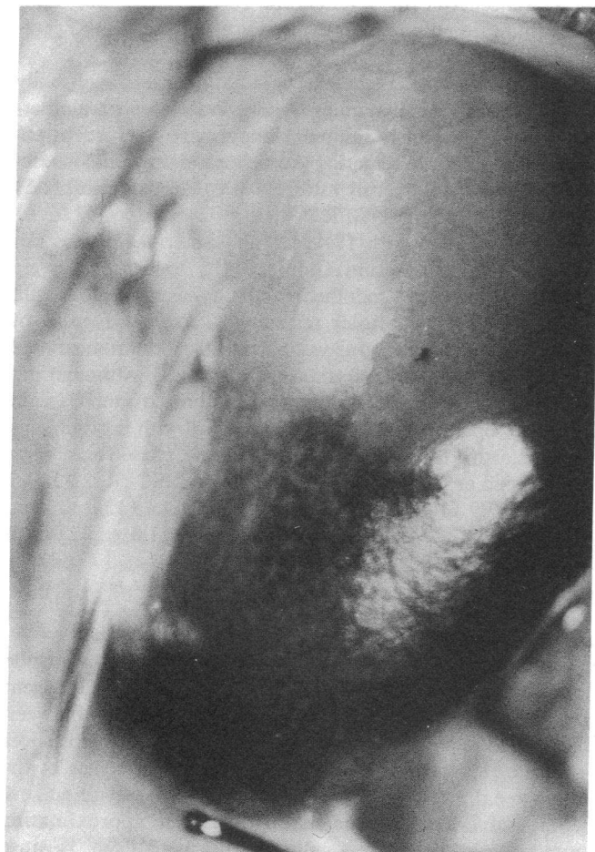
Figure 1. Appearance of the kidney during infusion of endothelin (2 ng/min) into the inferior branch of the main renal artery. The area of the kidney supplied by this vessel is profoundly vasoconstricted (blanching of the kidney surface).

After baseline measurements and collections from areas of the kidney supplied by the isolated artery branch as well as areas supplied by the other two branches of the main renal artery, human/porcine endothelin (0.4 ng/min; Peptides International, Louisville, KY) was infused. This dose was chosen because higher doses of endothelin (0.8–4.0 ng/min) caused a marked vasoconstriction of the infused portion of the kidney, sufficient to blanch the surface of the kidney (Fig. 1). The infusion was accomplished through a sharpened micropipette with a 20–30- \mu m opening, mounted to a micromanipulator and connected by polyethylene tubing to a syringe microinfusion pump (model 22; Harvard Instruments, S. Natick, MA). The pipette was advanced through the wall of the previously isolated branch of the renal artery and the infusion continued at a rate of 0.3 ml/h. The infusion pump was calibrated in vitro as we have previously described (7). After 20 min, repeat micropuncture measurements and collections were obtained from areas infused with endothelin and those regions of the kidney not infused with endothelin. In another five rats, we infused PBS in a manner identical to that described for endothelin.