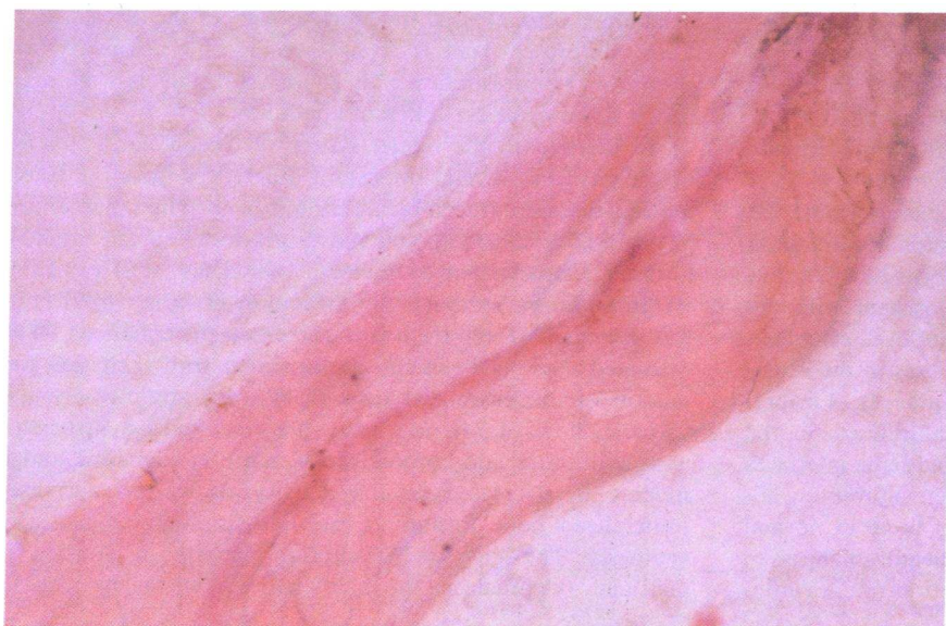
Figure 2. (bottom) Microscopic appearance of a bone biopsy from a group 2 dog after vitamin D repletion and continued aluminum administration. A previously unstained 5- \mu m section, reacted with a histochemical stain, has evident red-stained aluminum in a cement line. The presence of aluminum in the cement line indicates that mineralization had occurred at an osteoid-bone interface where aluminum had been previously deposited.