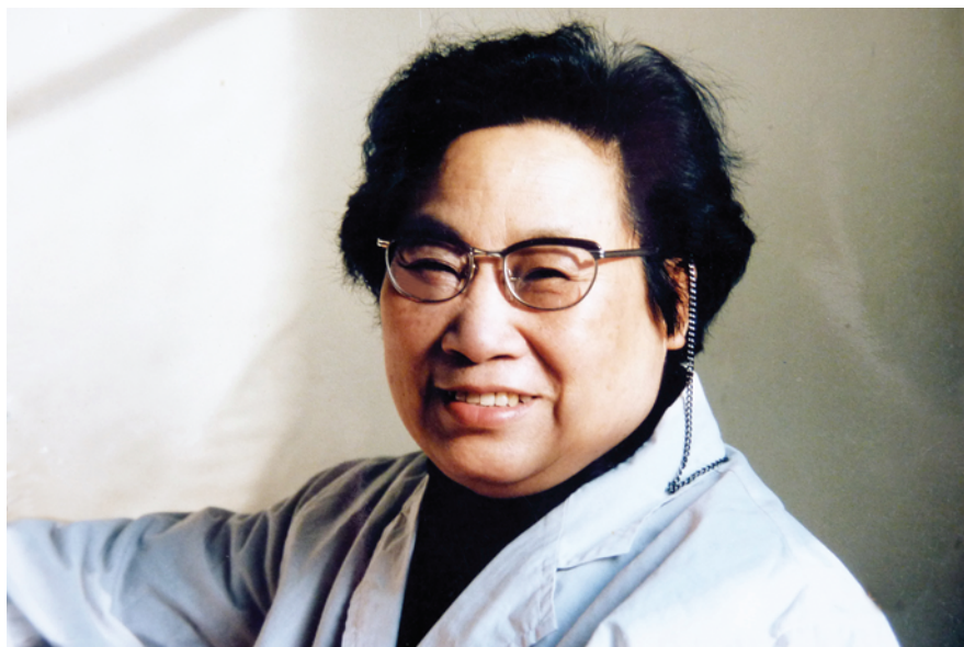
Figure 1 Youyou Tu, winner of the 2011 Lasker~DeBakey Clinical Medical Research Award.

The first symptoms in an infection usually occur ten days to four weeks after infection, though they can appear as early as eight days or as long as a year after infection. Most symptoms are caused by the release of merozoites into the bloodstream,