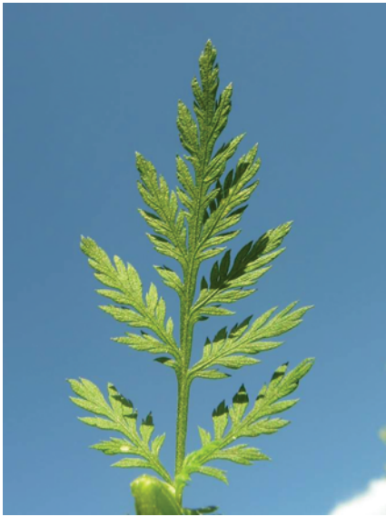
Figure 4 Artemisia annua L., or sweet wormwood.

about the project are still cloaked in secrecy (8). However, it is known that in early 1969, Tu was named the head of the team at her Institute. Tu recalls, “The reason I was appointed as the head of the Project 523 research group was partially due to the fact that I received training on both modern pharmaceutical sciences and traditional medicine and due to my hard work.”