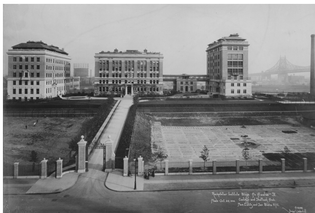
Figure 1 The Rockefeller Institute, New York City. Founded by John D. Rockefeller, the Rockefeller Institute not only symbolized a new sort of science, it was a key early supporter of the ASCI and the JCI .

In 1886 elite leaders of US medical schools had banded together to found the Association of American Physicians (AAP). Tellingly, they also considered naming the organization the “Association of Physicians and Pathologists” (4, 5). This alternative name reflected their dominant model of medical research, which was firmly rooted in older, pathology-based ideas about how to do medical research. Basing their scholarly approach on evidence provided by postmortem pathological findings, 19th-century physicians had